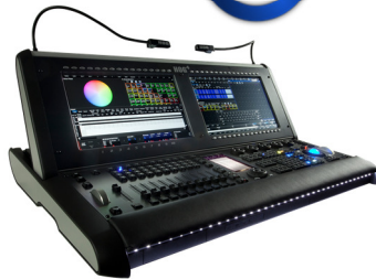
Hog 4 & Rack Hog

Beta Demo of Plot Views & Internal Pixel-Mapping