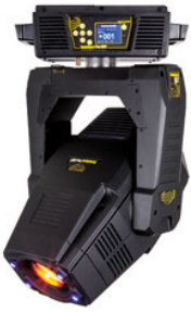
SolaSpot PRO 1500

20,000 Lumens / 5:1 Zoom Shutters & Animation FX