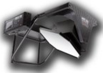
Moving Mirror System

Moving 7K HD Projector On-Board Axon HD Server