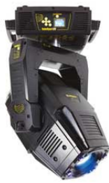
SolaSpot PRO CMY

20,000 Lumens / 5:1 Zoom Shutters & Animation FX